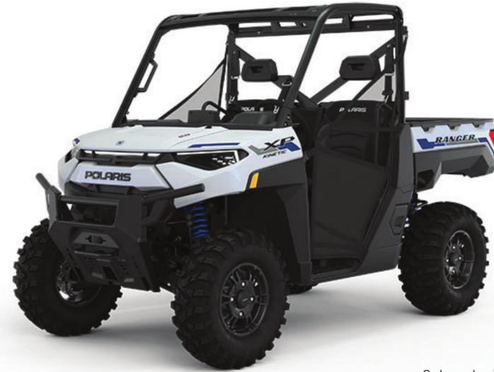
Colour: Icy White Pearl