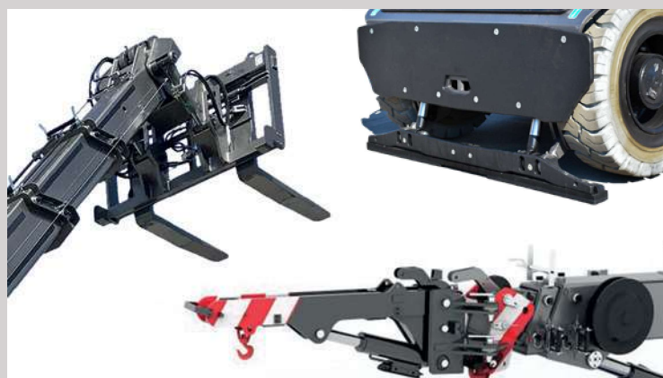
Optional fork attachment, fly jib and stabiliser crossbar

Product specifications are subject to change without prior notice or obligation. The photographs and/or drawings in this document are for illustrative purposes only