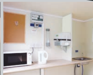
Well equipped canteen