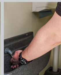
Delivery of hot water