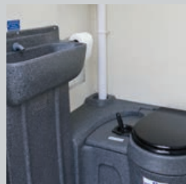
Toilet wash area