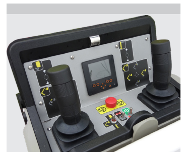
LMC controls with variable outreach