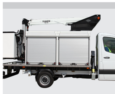
Cabinets for the chassis (optional)