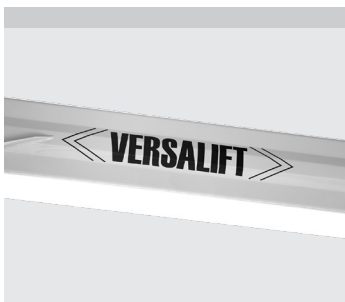
2 stage telescopic boom with articulating flyboom

Sideboards for the chassis Cabinets for the chassis Lithium-Ion power pack Outrigger pads with holder