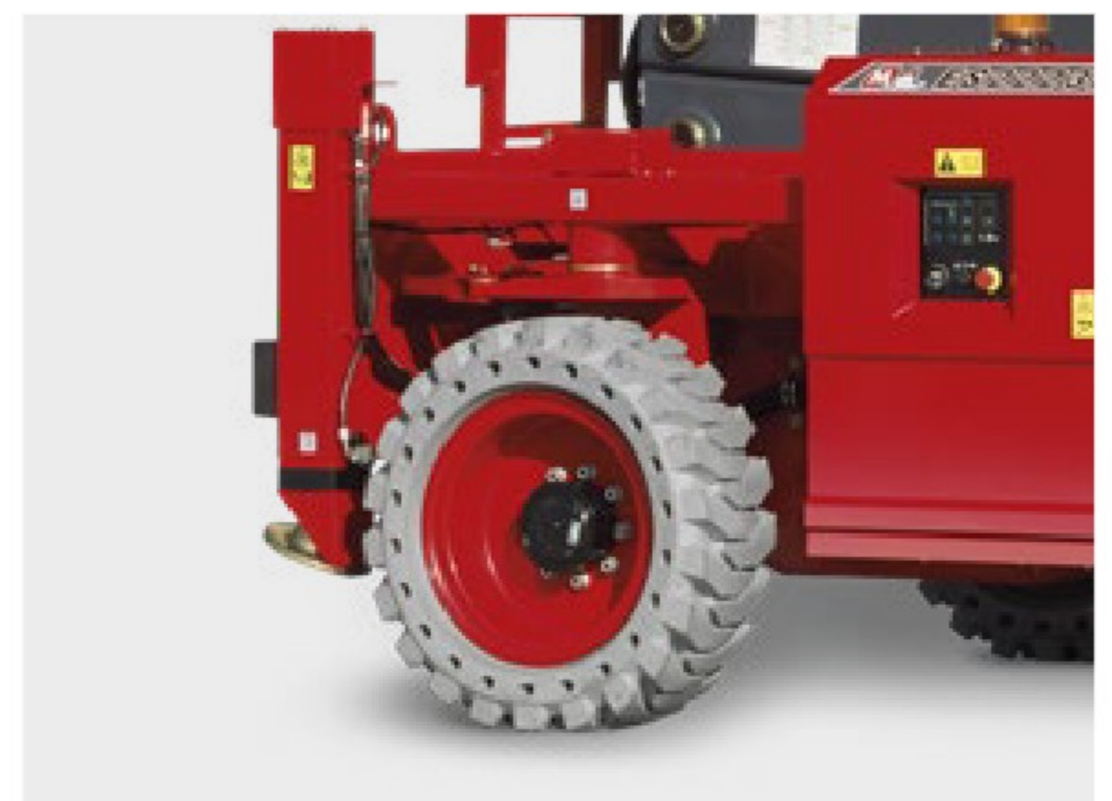
Non-marking solid tyres