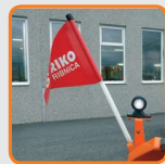
Signalisation with end-outline flags