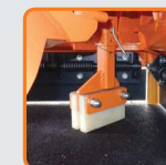
Middle slider with rubber footing