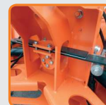
Leaf spring (for levelling the plough tilt)