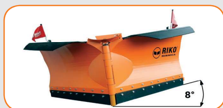
Tilt adjustment of plough: up to 8°. The plough is levelled by the leaf spring.