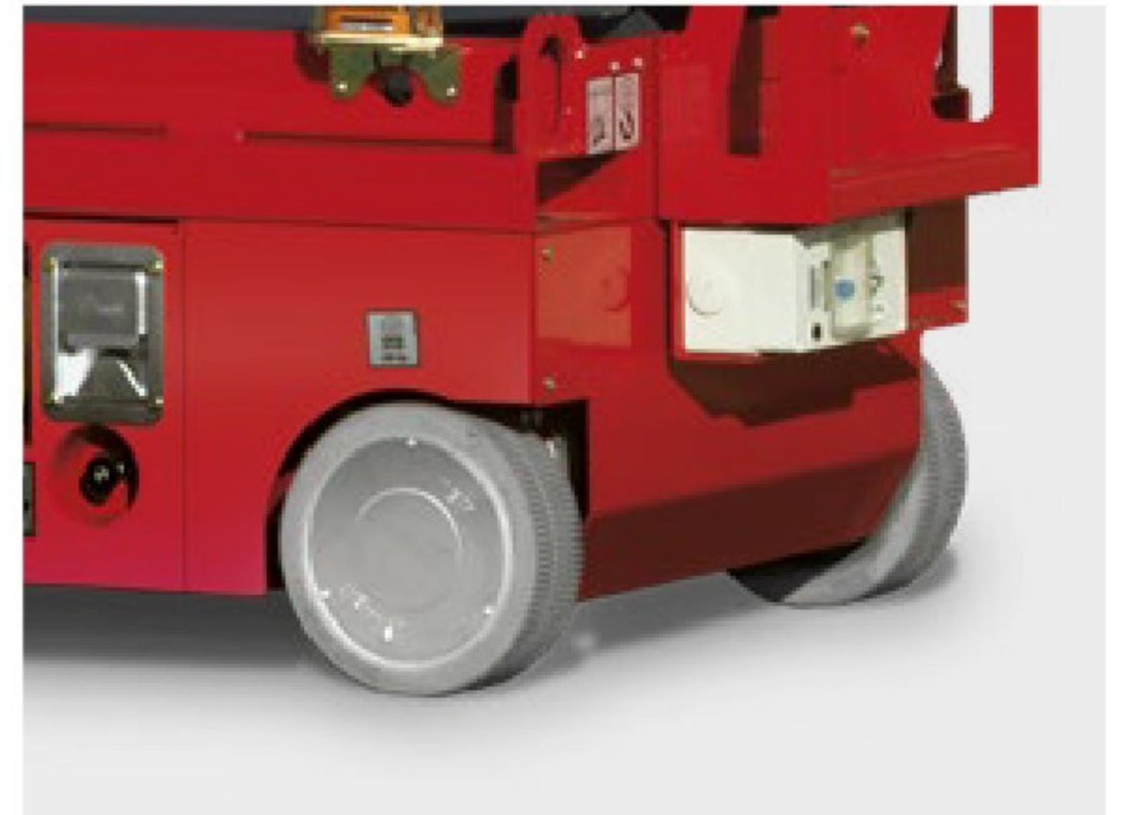
Non-marking solid tyres